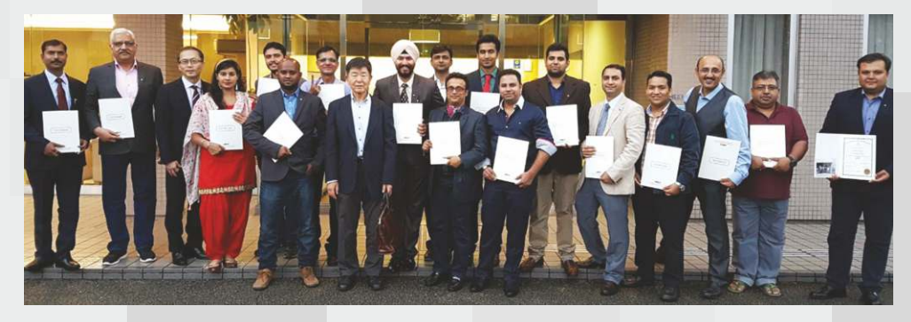
CII HIDA Training Programme on Production Management, 13-26 October 2016, Osaka, Japan