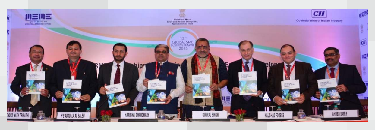
Launch of Technology Facilitation Centre on 22 November 2016 at 13th Global SME Business Summit

The Centre has partnered with leading technological solution providers in order to facilitate the technology upgradation of Indian MSMEs through CII's online portal www.mycii.in by matchmaking between the technological solutions offered by its technical partners and MSME technological requirements. Managed by a team of experts, the Centre will also provide handholding support to MSMEs to efficiently adopt various technological solutions. The Centre will also provide a platform for demonstration of technological solutions by its partners through roadshows in various Tier I and Tier II cities. webinars and online master classes in order to create technological awareness and provide market expansion opportunities to its partners.